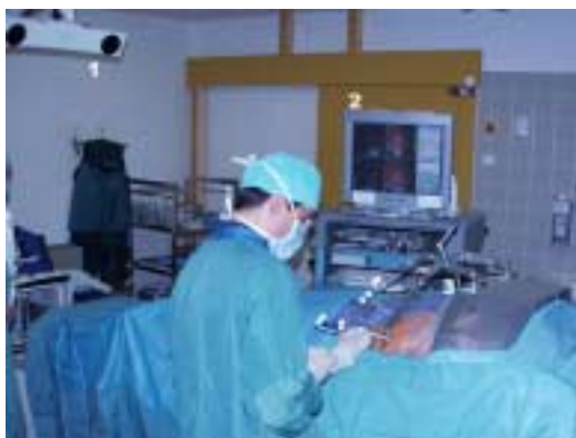
Figure 2: Computer-assisted bone tumour biopsy of a pelvic tumour in the CT scanner room: camera (1), monitor of navigation system (2), targeting device with tracker of navigation system (3). The patient is immobilized in the BodyFix in prone position.