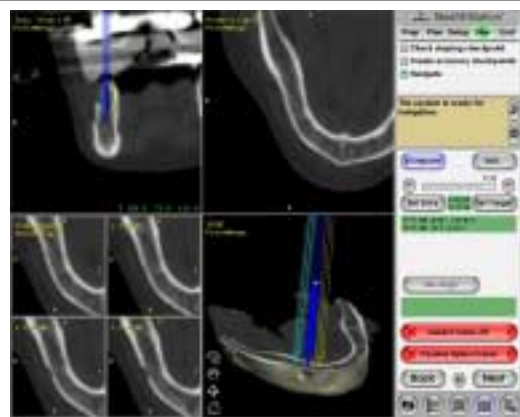
Figure 4: Planning of 3 dental implants using the Treon navigation system.

A novel image guided template production technique for placement of dental implants was developed (Widmann, thesis) and has been transferred from phantom studies to initial clinical studies. The implants are planned based on preoperative CT. An individualized template with drill guides for the dentist is fabricated in the SIP-Lab