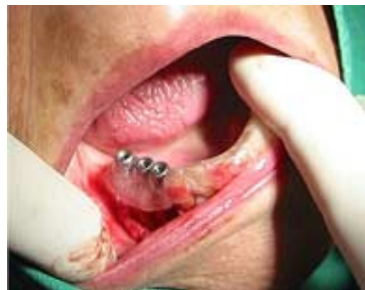
Figure 5: Individual template with drill guides for precise implantation of dental implants (Widmann, thesis).